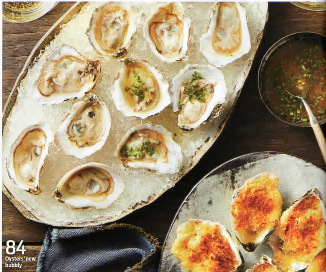
84 Oysters' new bubbly

Learn what international styles of the apple-based beverage bring to the dinner table, with recipes to pair.